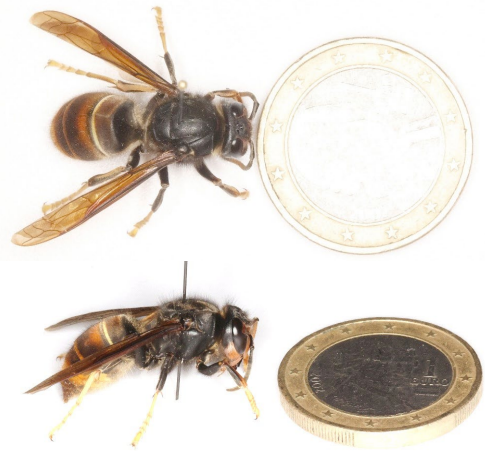
Fig. 2: Vespa velutina specimen after species identification and prior to dissection (1 Euro coin as reference; diameter = 23.25 mm).